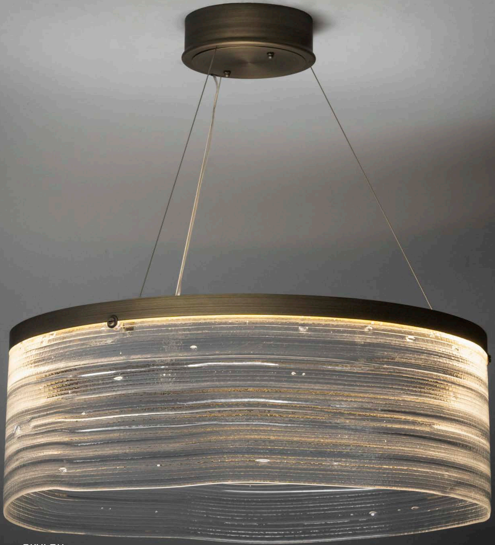
SKYLON 30" ANTIQUE BRUSHED BRASS